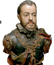
Philip II of Spain

Philip II expanded his holdings by taking control of Portugal when the king of Portugal, his uncle, died without an heir. Philip also got its global territories in Africa, India, and the East Indies. When he tried to invade England in 1588, though, he failed. The defeat made Spain weaker. However, Spain still seemed strong because of the wealth— gold and silver—that flowed in from its colonies in the Americas.