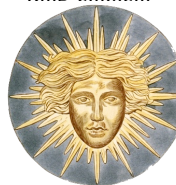
Louis XIV's 'Sun King' emblem

War of the Spanish Succession War fought by other European nations against France and Spain when those two states tried to unite their thrones