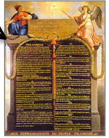
Declaration of the Rights of Man

15. What did the Declaration of the Rights of Man say and how did it seize power?